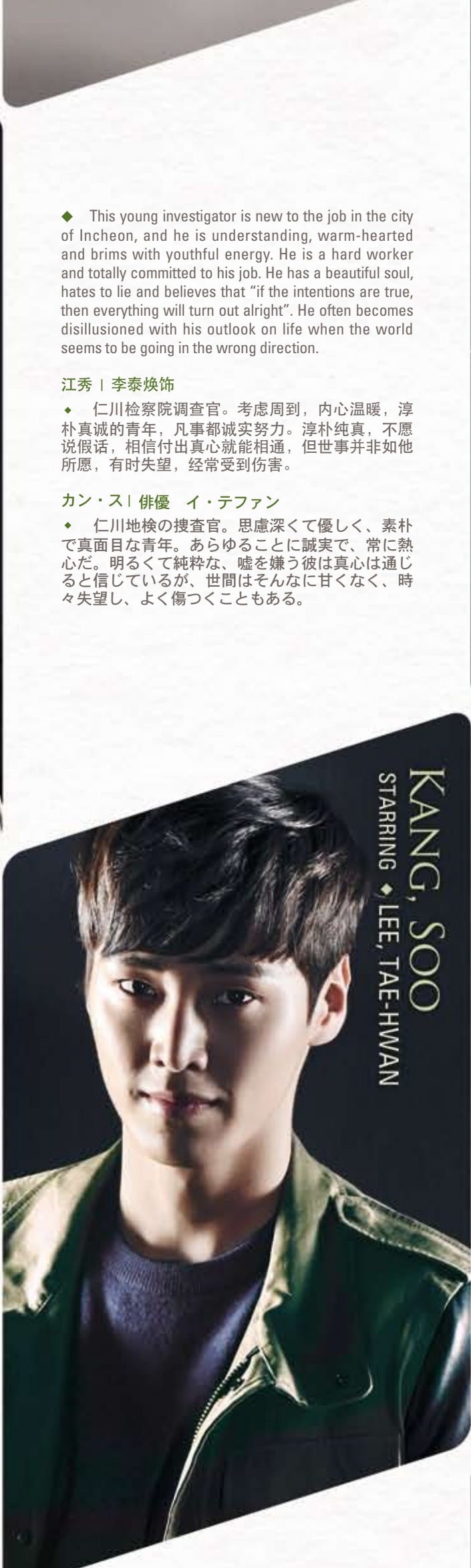
KANG, SOO-LEE STARRING ◆ LEE, TAE-HWAN

◆ ロースクール出身の仁川地検の見習検事。勉強が苦にならない秀才。抜け目がなく大胆、明るくて清らかだが、本心が読めない秘密めいた裏の部分も持っている。意欲に実力が伴わず苦戦するが、最後まで追求する執拗さと、正面突破する忍耐強さで決定的な一手を打つことができる。法律は被害者のための武器であり、検事の仕事は被害者の代わりに悪人を処罰することだと思っている。